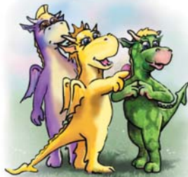
Baz Nubinu Spotted Richie

PLOP! Onto the Dream Dump your dreams then fall, And Doowott turns up to tidy them all! He never knows what magic he will find, Lost and forgotten by your sleepy mind.