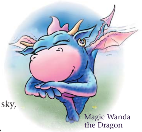
Magic Wanda the Dragon

Cloaked by fluffy white clouds up in the sky, The Island of Nimbi slowly floats by. It's home to Wanda, Baz and Nubinu, Richie, Mix-it-well, Mo and Doowott too!