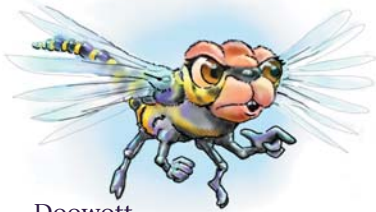
Doowott the Dragonflyer

Whilst moonbeams play and you're sleeping at night, Mix-it-well rides on his Stirring-wheel bike. He pedals away making magic steam, Which drifts down to earth to bring you your dreams.